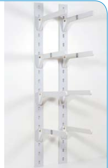
Available in 3 heights: 800mm high, 1200mm high, 2400mm high.