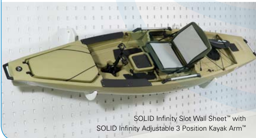
SOLID Infinity Slot Wall Sheet™ with SOLID Infinity Adjustable 3 Position Kayak Arm™