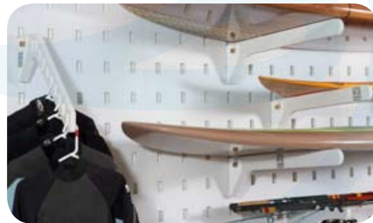
SOLID Infinity Small Wetsuit Arm™, SOLID Infinity 650mm Straight Arms™ & SOLID Infinity Fishing Rod 8 Arm™