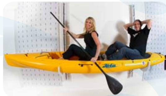
SOLID Infinity Support Posts™ with SOLID Infinity Curved Watercraft Arm™ with Paddle Storage (top & bottom) SOLID Infinity Adjustable Strap Watercraft Arm™ with Paddle Storage (middle)