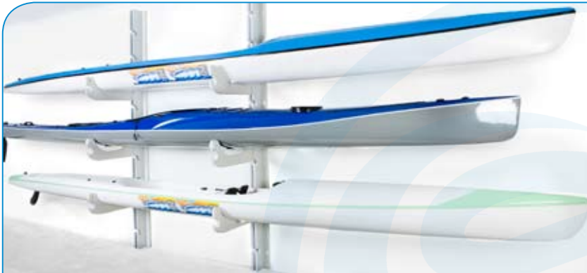
SOLID Infinity Support Posts™ with SOLID Infinity Custom Hobie Arms™ holding over 200KG!