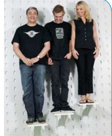
SOLID INFINITY Slot Wall Sheets are 2400mm x 1200mm x 25mm thick and are perforated for either portrait or landscape installation.

to suspend vanity units, entertainment furniture and equipment, filing cabinets, shelving and kitchen cabinets etc. Ideal for medical & hospital and educational facilities, demountable & pre-fabricated housing, government, aged care and high rise building, office, retail and industrial applications.